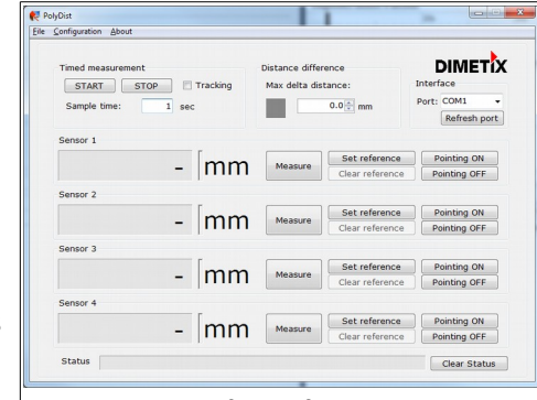
Pic 2: User interface of PolyDist

PolyDist offers you a simple solution that has already proven itself in several applications. The application consists of the following components: